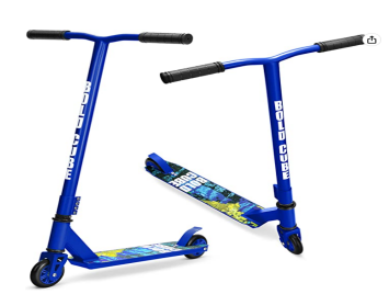
The winners are: Lily in EYFS Angus in Y5