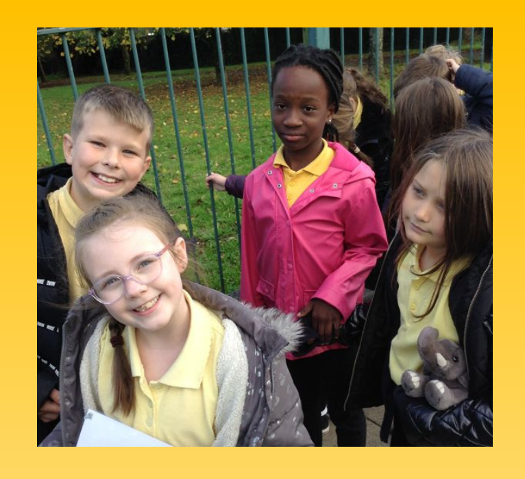
Integrity went on a Pilgrimage to our local Co-op.