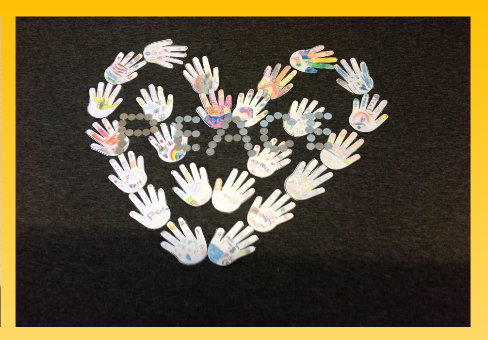
Peace Class went on a Pilgrimage to the Cabin Nursery.